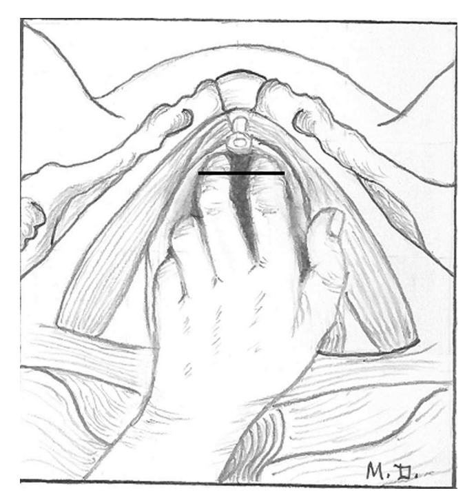
Fig. 1 . Illustration indicating where the fingers are placed in the vagina to determine the new parameter "width between insertion sites". Solid line indicates where the measurement is made.

Digital assessment of LA integrity was then conducted and included the following: (1) feeling for continuity of the puborectalis muscle at its insertion sites on either side of the pubic bone. A positive result (avulsion) was recorded if it was possible to feel a discontinuity of the muscle with the bone, or absence of muscle on each side, (2) determining the distance between the insertion points of the puborectalis muscle measured using finger widths, that is, three fingers equate to approximately 4 cm (as with diastasis recti), which gave one measure (Fig. 1), (3) LA strength using previously validated modified Oxford grading scale (0-5),16 side dependent, and (4) grading of resting tone of the LA muscle using a verified scale, also side dependent.<sup>17</sup> A modified template from a previous publication<sup>8</sup> was used to record the data from the palpation (Fig. 2). The physiotherapist performing the digital LA assessment was blinded to the ultrasound results as well as parity and mode of delivery of the participant.